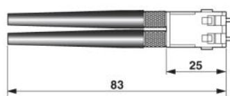
SCRJ plug connector, POD, IP20