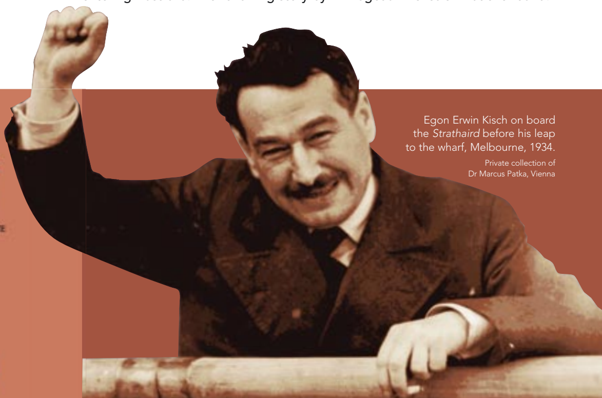
Egon Erwin Kisch on board the Strathaird before his leap to the wharf, Melbourne, 1934.

KISCH PROTEST MEETING STADIUM DUDLEY STREET, WEST MELBOURNE SUNDAY NOV. 18 at 7.30 p.m. KISCH MUST LAND