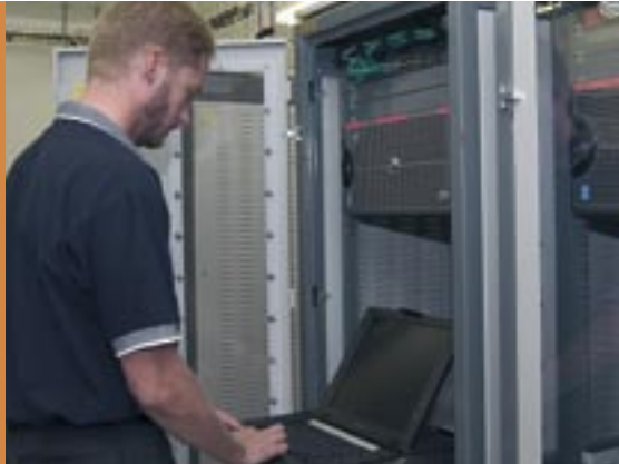
The National Archives digital repository.

Does your new personal computer have a floppy disc drive? Are you able to read that old university essay you saved in wordperfect software? Are you confident that you will still be able to view your digital photographs in 20 years?