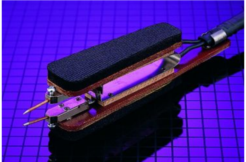
Regular Tweezer Handpiece Model 10541

Ideal tool for intricate soldering applications, combining intense heat with precise contact points.