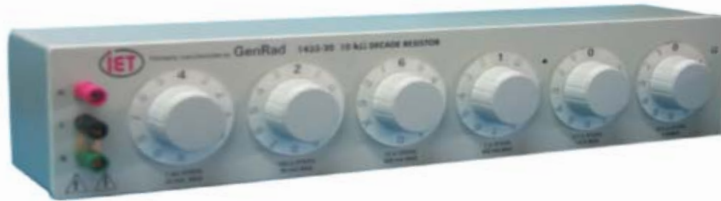
Model 1433 Precision Decade Resistor

The 1433 Decade Resistors are primarily intended for precision measurement applications where their excellent accuracy, stability, and low zero resistance are important. They are convenient resistance standards for checking the accuracy of resistance measuring devices and are used as components in dc and audio frequency impedance bridges. Many of the models can be used into the radio-frequency range.