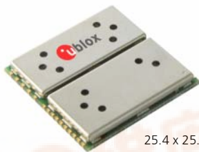
25.4 x 25.4 x 3 mm

The TIM-LR is an ultra-low power sensor-based dead reckoning GPS module suitable for passive and active antennas. The combination of the ANTARIS GPS positioning engine and the Enhanced Kalman Filter EKFT™ algorithm provide precise navigation in locations with no or impaired GPS reception, for example tunnels, indoor car parks and deep urban canyons. Deviations in navigation caused by multipath effects, as commonly observed in cities with densely populated high-rise buildings, belong to the past. The TIM-LR is the ideal solution for high-volume applications requiring a cost-effective and tightly integrated product that fulfills 100% road coverage requirement.