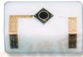
PD100-003-0xx Ceramic Sub-Mount