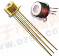
PD100-003-1xx TO can Package