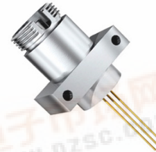
PD100-003-5xx FC Receptacle