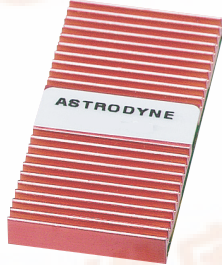
Unit measures 1"W x 2"L x 0.375"H