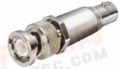
CASE STYLE: FF747