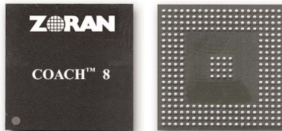
17cm x 17cm

For more information, contact Zoran's Sunnyvale office or the office nearest you: