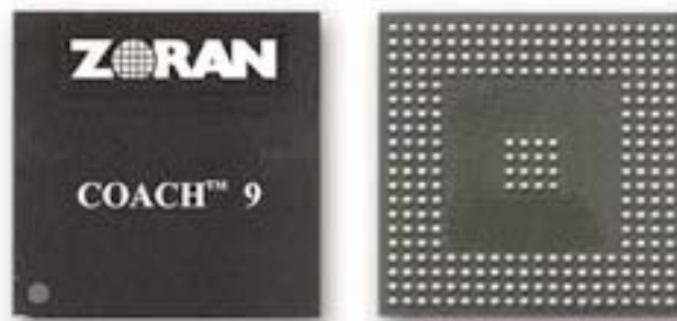
17cm x 17cm

For more information, contact Zoran's Sunnyvale office or the office nearest you: