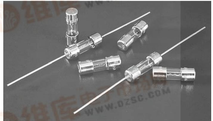
225 000 Series