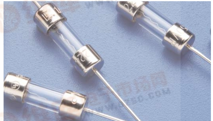
2206 000P Series

Wave solder- 500°F(260°C), 3 seconds Max. Reflow solder- Not recommended