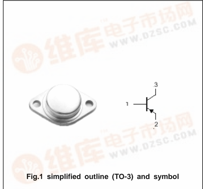
Fig.1 simplified outline (TO-3) and symbol