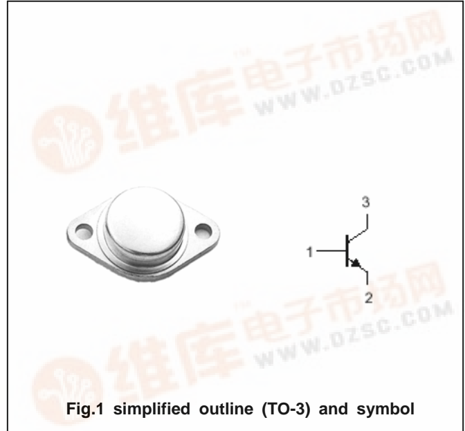
Fig.1 simplified outline (TO-3) and symbol