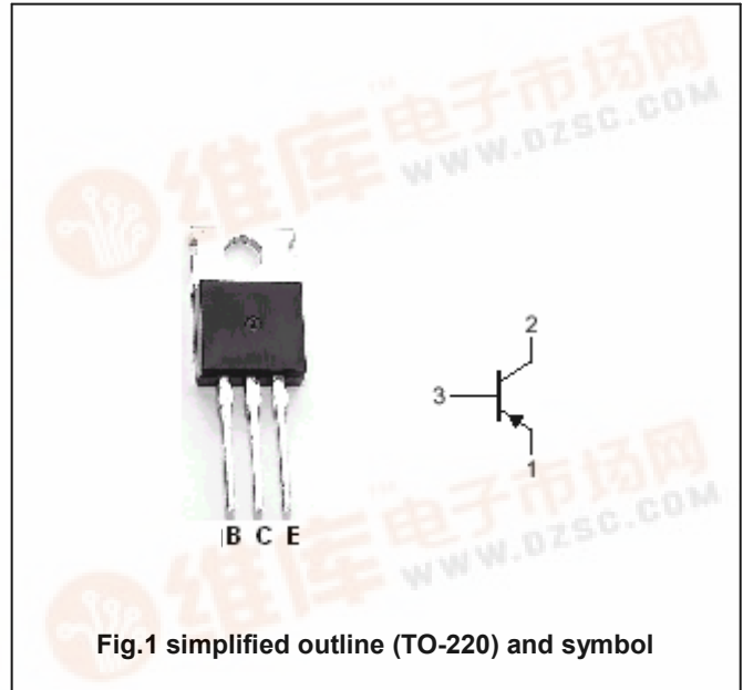
Fig.1 simplified outline (TO-220) and symbol