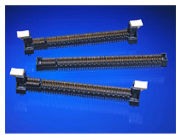
iCool Vertical versions