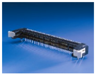
iCool Right Angle versions