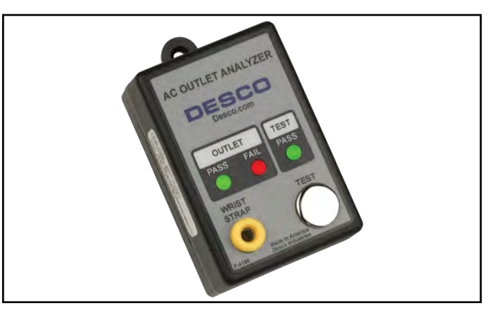
Figure 1. Desco <u>98132</u> AC Outlet Analyzer and Wrist Strap Tester