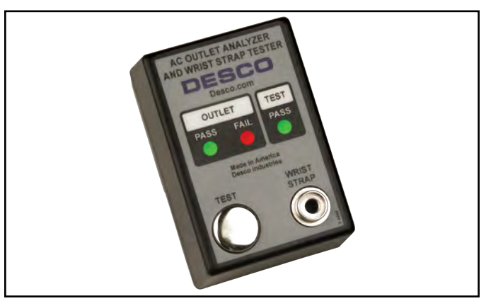
Figure 2. Desco <u>98131</u> AC Outlet Analyzer and Wrist Strap Tester