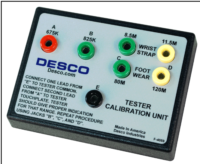
Figure 3. Desco 07010 Calibration Unit

View technical bulletin TB-2039 for more information on the 07010 Calibration Unit and instructions to calibrate the Wrist Strap Tester.