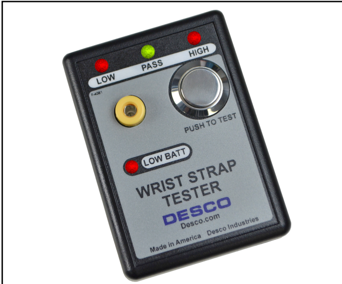
Figure 1. Desco 19240 Wrist Strap Tester