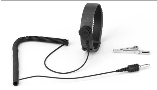
Wrist Band 4600 Series shown with ground cord and alligator clip

The 3M™ Adjustable Wrist Straps 4600 Series feature a thermoplastic band with an integrally molded conductive interior. The wrist strap utilizes an easy on/easy off adjustable “zipper” style latching mechanism and is available with 4 mm snaps and 5 ft. ground cords. (10 ft. ground cord available with 4 mm snap only.) All wrist straps and cords include alligator clips.