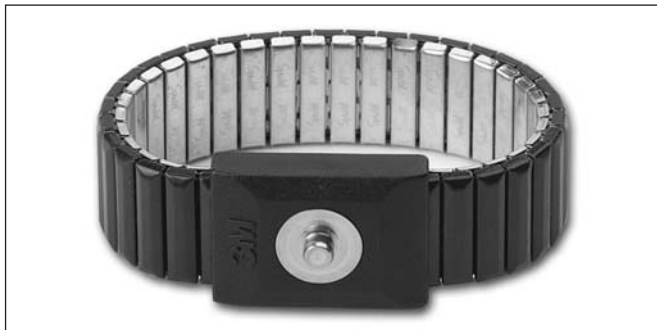
3M™ Wrist Band 2205 Series

Three sizes are available: small for wrists from 4.5 in. to 6 in. (114 mm to 152 mm) in circumference; medium for wrists from 5.5 in. to 7.25 in. (140 mm to 184 mm); and large for wrists larger than 6.5 in. (165 mm). All wrist strap sets include an alligator clip, which fits over the installed banana jack on the ground cord, to provide an alternative ground attachment method. Available with 4 mm snap end.