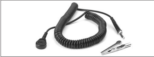
Ground Cord 2210

3M™ Wrist Strap Ground Cords 2210, 2220 and 4610 Series are highly durable with segmented strain relief, and a single bundle of tinsel conductors laced for great strength and reinforced with strong synthetic fibers. These features provide long cord life and easy movement. Each cord has a 1 megohm resistor molded into the snap end. All wrist straps and cords include alligator clips.