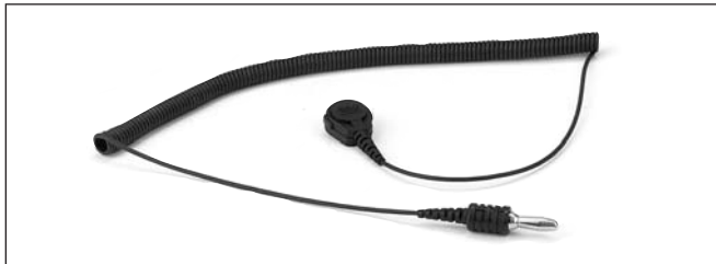
Ground Cord 4610 (includes Alligator Clip not shown)