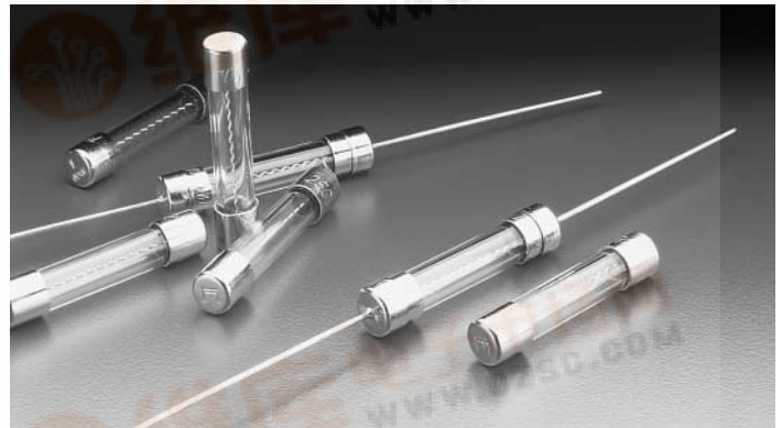
312 000 Series