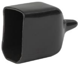
Assorted Covers Rear Cover