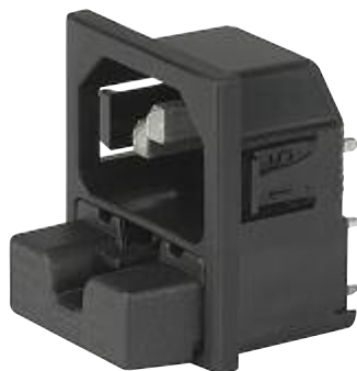
Appliance inlet with fuseholder