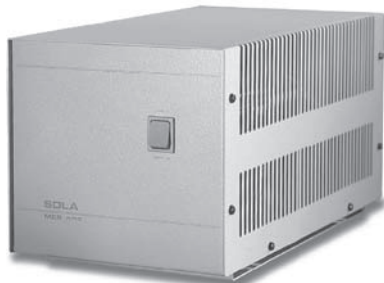
MCR Portable Series

The MCR provides excellent noise filtering and surge protection to protect connected equipment from damage, degradation or misoperation. Combined with the excellent voltage regulation inherent to Sola/Hevi-Duty's patented ferroresonant design, they can increase the actual Mean Time Before Failure (MTBF) of protected equipment. These units are a perfect choice where dirty power caused by impulses, swell, sags, brownouts and waveform distortion can lead to costly downtime because of damaged equipment.