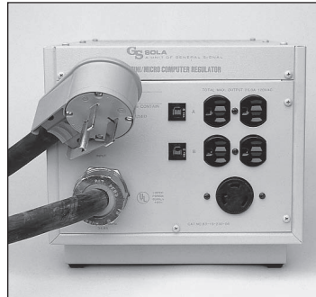
60 Hz, 2000–3000 VA, (4) 5-15R and (1) L5-30R Receptacle