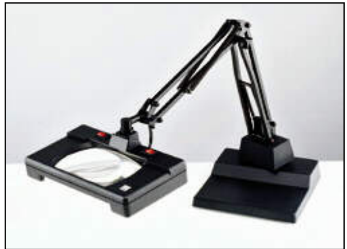
7452 - Desk Base WIDEX