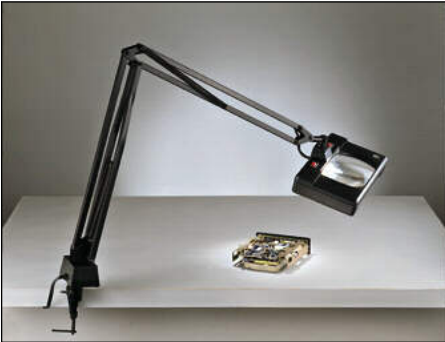
7450 - Clamp-on WIDEX