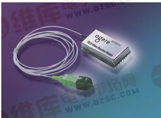
The broadband 7810 video receiver module is a versatile, state-of-the-art solution for a variety of network applications.