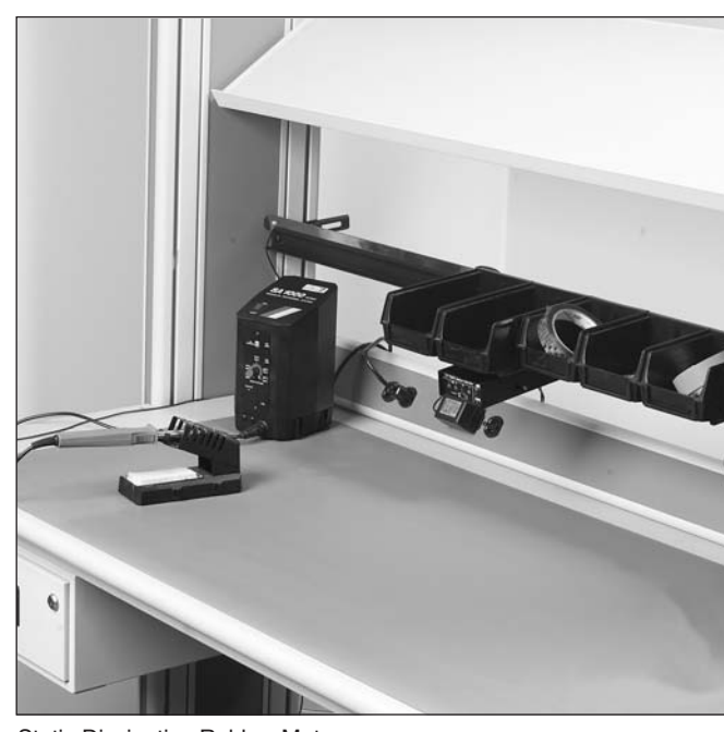
Static Dissipative Rubber Mat

Dissipative table runners include two 15 ft. (4,6 m) 3M Ground Cords 3040 and five 3M Snap Fasteners 3034 to be installed by the user.