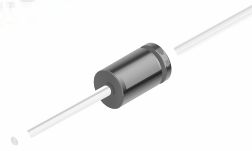
DO-35 Glass case COLOR BAND DENOTES CATHODE