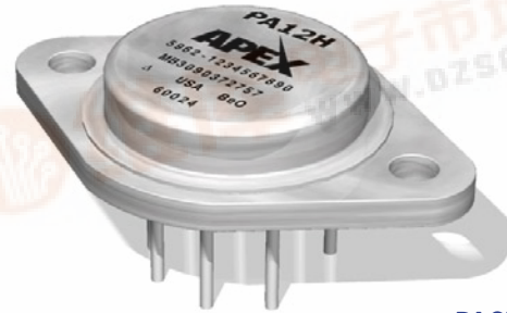
8-PIN TO-3 PACKAGE STYLE CE