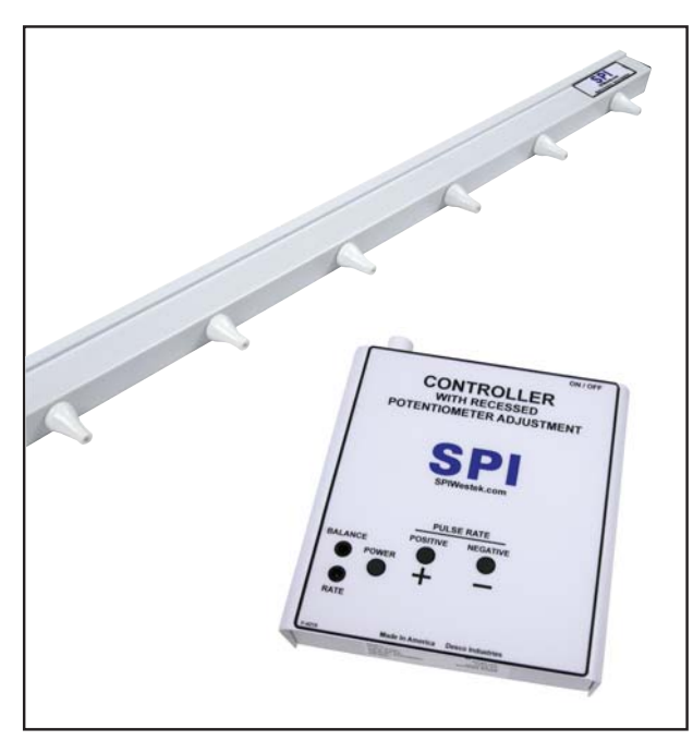
Figure 1. SPI Ion Bar and 94240 Controller