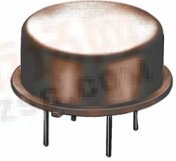
CASE STYLE: PP120 PRICE: $73.95 ea. QTY (1-9)