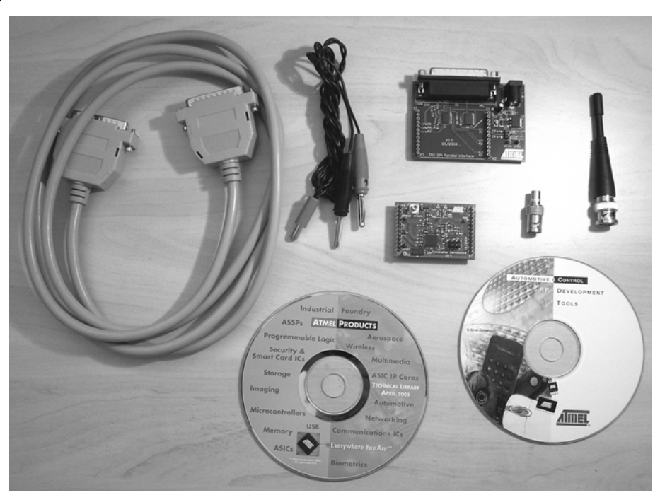
Figure 2-1. Kit Contents

The transceiver kit consists of a transceiver base station board, an SPI2LPT interface board, a DC supply cable, a parallel port cable, and a CD-ROM with the appropriate software, as depicted in Figure 2-1. The transceiver board and the SPI2LPT interface board have to be ordered separately.