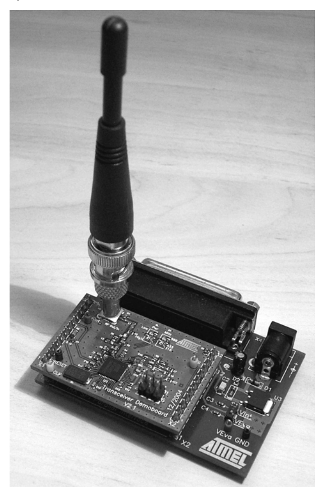
Figure 3-2. Assembly of the Kit