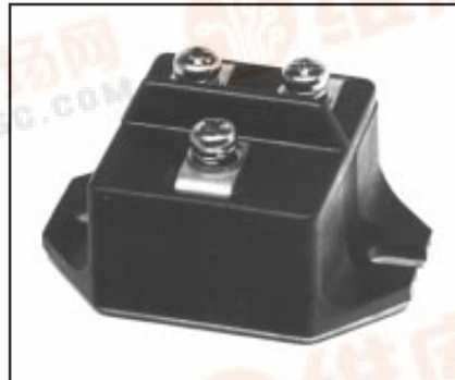
CN24__020N, CC24__020N Super Fast Recovery Dual Diode Modules 20 Amperes/300-600 Volts