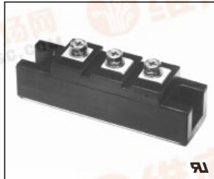
CDD11210, CDD11610 Dual Diode POW-R-BLOK™ Modules 100 Amperes/1200-1600 Volts