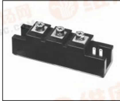
CM4212A2, CM4216A2 SCR/Diode POW-R-BLOK™ Modules 25 Amperes/1200-1600 Volts