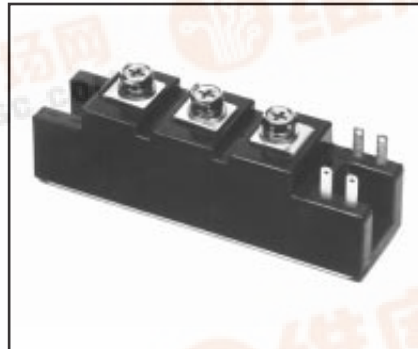
CM4312A2, CM4316A2 Dual SCR POW-R-BLOK™ Modules 25 Amperes/1200-1600 Volts