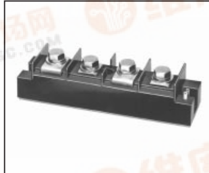
CM531213, CM531613 Dual SCR POW-R-BLOK™ Modules 130 Amperes/1200-1600 Volts