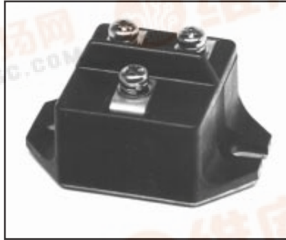
CS241020 Fast Recovery Single Diode Module 200 Amperes/1000 Volts