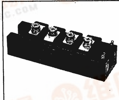
JT220510 Split-Dual FETMOD™ Power Module 100 Amperes/50 Volts