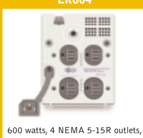
includes 1 UniPlug adapter