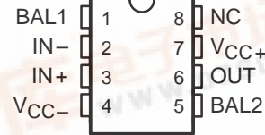
D OR P PACKAGE (TOP VIEW)