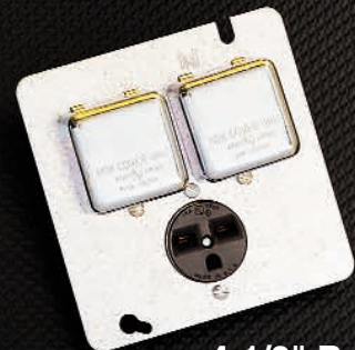
4-1/2" Box LSKA