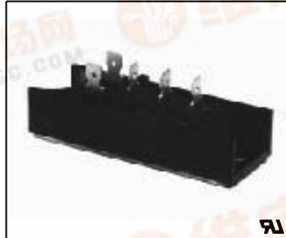
ME700802 Three-Phase Diode Bridge Modules 20 Amperes/800 Volts