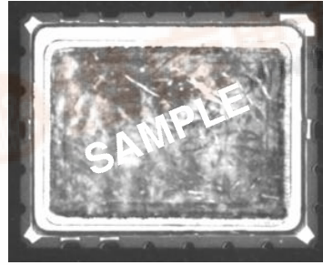
Package Size : 9.6mm x 7.6mm x 1.6mm