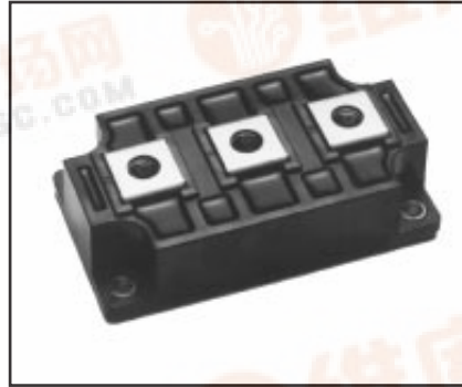
RM300CA-9W Fast Recovery Welder Diode Module 300 Amperes/450 Volts