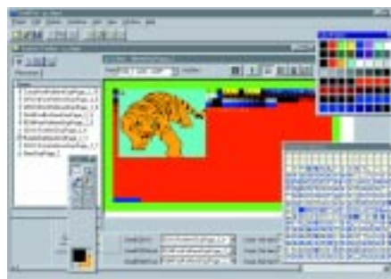
TEDIPRO for Fast & Easy OSD-Development

The SDA 555x is available in samples now and will be ready for mass production from beginning of year 2000 onwards. Please contact your local Infineon Office for further details.