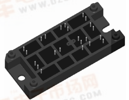
Mains Rectifier Bridge D1 - D4