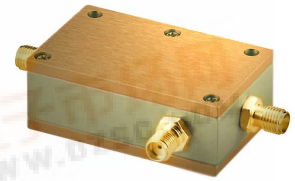
CASE STYLE: FM587 PRICE: $49.95 ea. QTY (1-9)