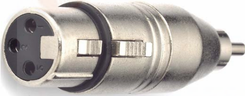
Model 7269 XLR (F) / RCA (M)