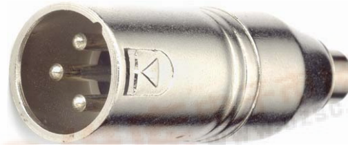
Model 7272 XLR (M) / RCA (F)