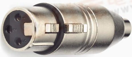
Model 7271 XLR (F) / RCA (F)