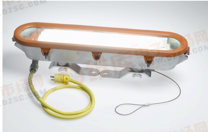
Wide-Area Fluorescent Light For Class I, Division 2 and Zone 2 Applications

For additional product information, please visit: http://www.molex.com/link/widearea.html and http://www.woodhead.com .