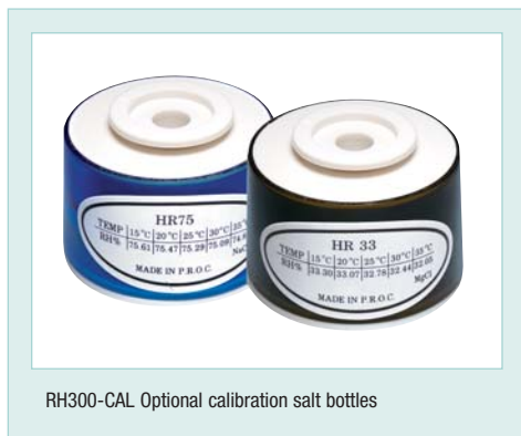
RH300-CAL Optional calibration salt bottles